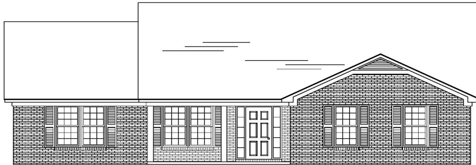
FRONT ELEVATION - A

Contact us for a modification estimate! Make changes to this stock plan for a unique home that suits your exact wants and needs!